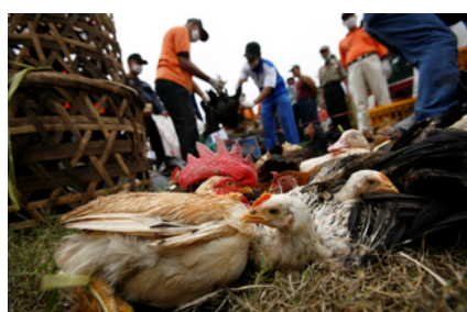
Response Preparedness for Zoonotic Disease Outbreaks Using a One-Health Approach

#END TB Channel E-LEARNING COURSE ON TUBERCULOSIS AND MENTAL HEALTH