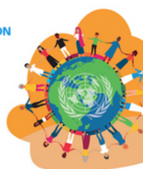
Tuberculosis and Mental Health

#END TB Channel E-LEARNING COURSE ON TUBERCULOSIS AND MENTAL HEALTH