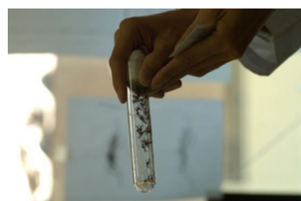
Introduction to Dengue