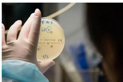
Antimicrobial Stewardship: un approccio basato sulle competenze (Italian)