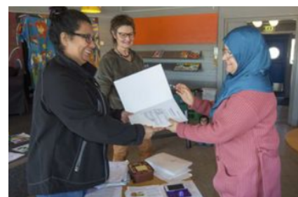
Migration & Health: Enhancing Intercultural Competence & Diversity Sensitivity