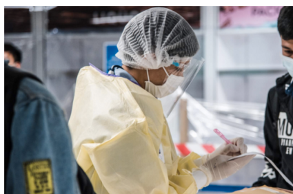
Occupational health and safety for health workers in the context of COVID-19