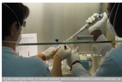
Лекарственно-устойчивый туберкулез: интерпретация результатов быстрых молекулярных тестов (Russian)