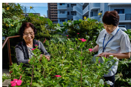
Long-term care facilities in the context of COVID-19