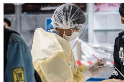
Occupational health and safety for health workers in the context of COVID-19