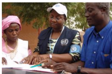
AFRO Integrated Disease Surveillance and Response Series: Course 2