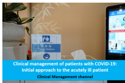
Clinical management of patients with COVID-19: Initial approach to the acutely ill patient