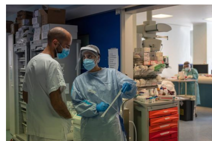
Prevention, identification and management of infections in health workers in the context of COVID-19