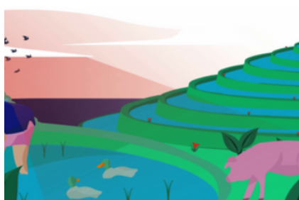
Navigating the Tripartite Zoonoses Guide (TZG): A training for advocates and implementers