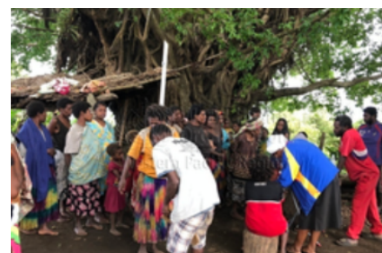
Scabies: Training of health workers at national and district levels on skin-NTDs