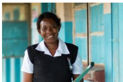
Recognizing and managing anaphylaxis