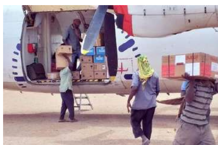
The Food Insecurity and Health Readiness and Response Strategic Framework