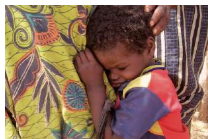
Noma: training of health workers at national and district levels on skin-NTDs