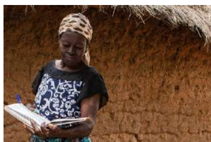
Onchocerciasis: training of health workers at national and district levels on skin-NTDs