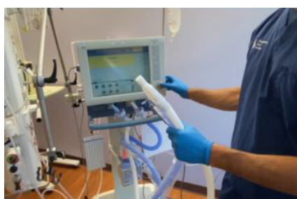
COVID-19 respiratory equipment