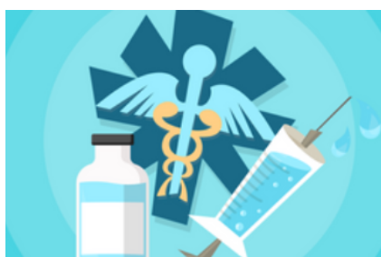
Vaccine safety basics