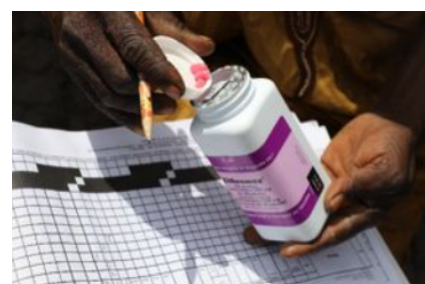
Safety in administering medicines for neglected tropical diseases