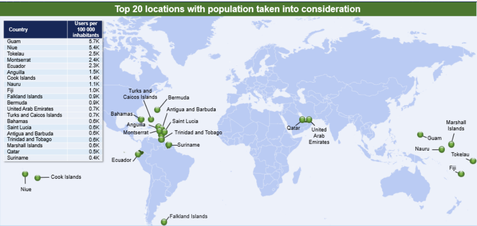
Figure 2: OpenWHO per capita enrolments

As a result of these efforts, the COVID-19 xMOOCs hosted by OpenWHO expanded learning to previously underrepresented groups, such as women, participants ages 70 and older, and learners younger than age 20. It was also observed that participation shifted toward low-and middle-income countries, which contribute nearly \frac{2}{3} of learners compared to \frac{1}{2} before the pandemic. When population is taken into consideration, small island states bring the highest proportion of learners, representing 16 out of the 20 top countries, territories and areas (Figure 2).